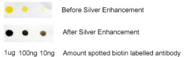
Figure 1. Detection of a biotinylated antibody spotted on a nitrocellulose membrane using streptavidin conjugated silver nanoparticles.